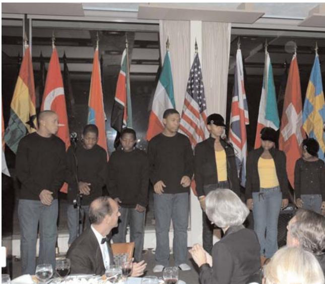
Children of Agape, South Africa, performed during the 2005 Gala.

is a chapter of the United Nations Association of the United States of America (UNA-USA), a not-for-profit, nonpartisan organization that supports the work of the United Nations. UNA-USA educates Americans about the work of the United Nations, and encourages public support for strong US leadership in the United Nations.