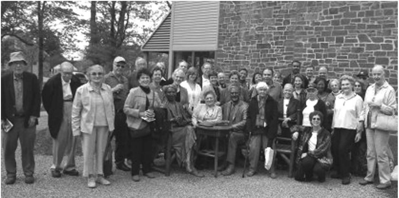
On May 6, members and friends visited the Roosevelt home at Hyde Park.

Several 2005–2006 programs were also devoted to exploring the work of various NGOs, because they are