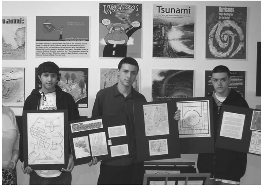
Students from the High School of Art & Design, New York City in the Visitor's Lobby of the UN show their art work on the theme "Natural Disasters: Their Happening, Effects and Prevention Strategies."