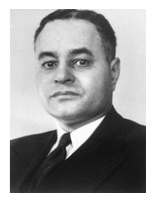
Diplomat Ralph Bunche